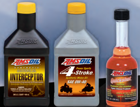
SYNTHETIC 2-STROKE OIL SYNTHETIC 4-STROKE OIL ACCESSORY PRODUCTS