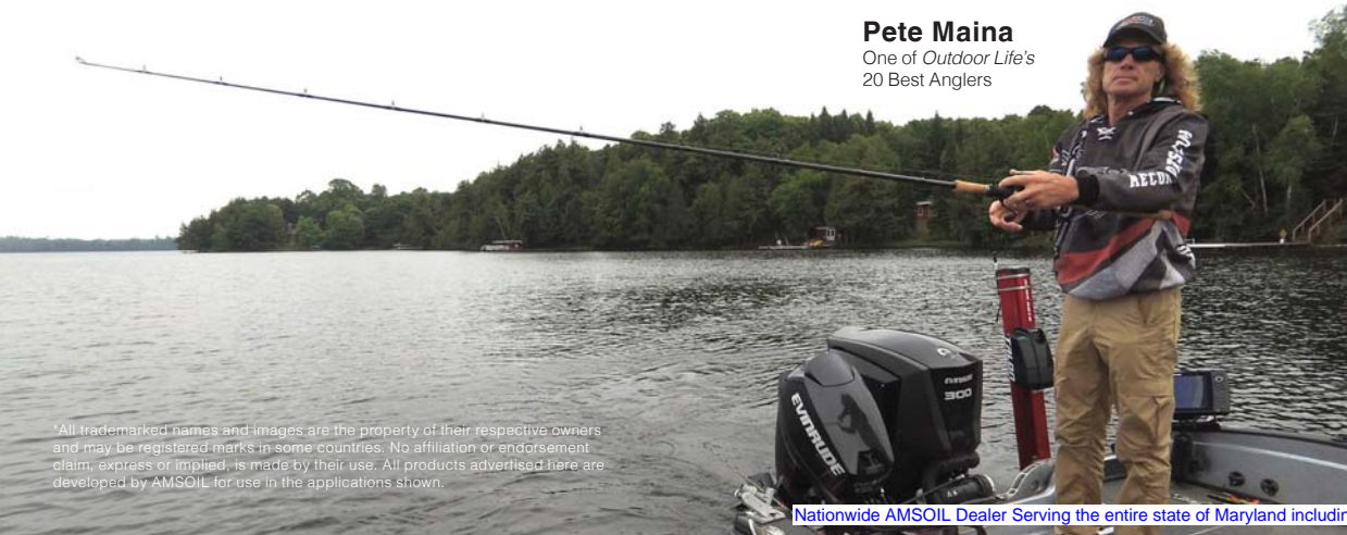
Pete Maina One of Outdoor Life's 20 Best Anglers

Watch the video. Visit www.youtube.com/amsoilinc and search "River Point Resort & Outfitting Co."