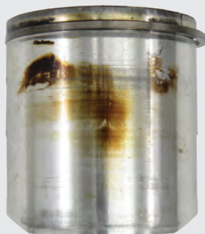
AMSOIL SABER Professional 300 Hours

Following 300 hours of professional-use testing in STIHL* string trimmers at the manufacturer mix ratio of 50:1, SABER Professional kept pistons and rings virtually free of carbon and wear (see the picture on the top), while use of a leading oil brand caused significant carbon buildup around the ring area (see the picture on the bottom). This engine is nearing the failure point.