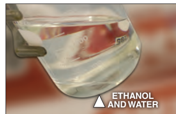
▲ ETHANOL AND WATER

Ethanol and water can separate from fuel and fall to the bottom of fuel tanks, reducing power and performance. Quickshot helps safely disperse water, preventing separation.