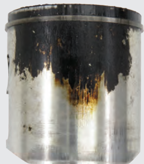
Leading Oil Brand 300 Hours