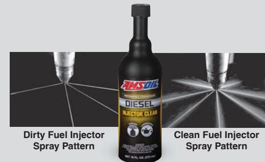
Dirty Fuel Injector Spray Pattern

Diesel Injector Clean also provides added lubricity, helping protect fuel pumps and injectors against premature failure.