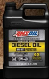
SYNTHETIC DIESEL OIL