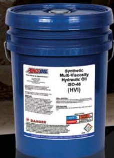
SYNTHETIC HYDRAULIC OIL