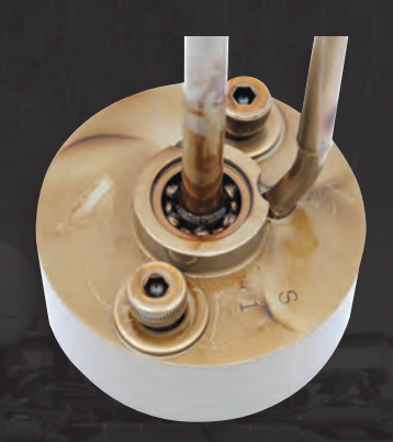
AMSOIL MULTI-VISCOSITY SYNTHETIC HYDRAULIC OIL (ISO 46)

In severe oxidation testing, AMSOIL Multi-Viscosity Synthetic Hydraulic Oil resisted elevated heat and oxidation more effectively than the conventional fluid. It helps hydraulic system components stay clean, operate reliably and last long.