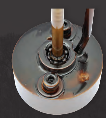
CONVENTIONAL HYDRAULIC OIL (ISO 46)

Aluminum Beaker Oxidation Test Tested April 2012