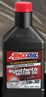
SYNTHETIC MOTOR OILS