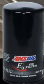
AMSOIL E a FILTERS