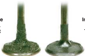
Intake Valve after P.i. Treatment