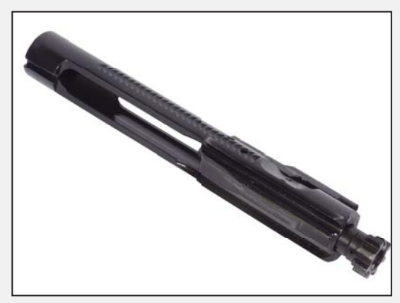
AMSOIL Synthetic Firearm Lubricant provided exceptional performance over rigorous range testing in multiple firearm applications.