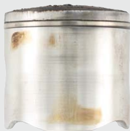
SABER Professional @ 100:1