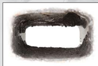
SABER Professional @ 100:1 4% Airflow Loss