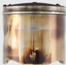
ECHO Power Blend @ 50:1