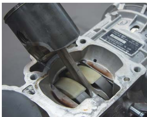
The pistons suffered only minor scuffing.